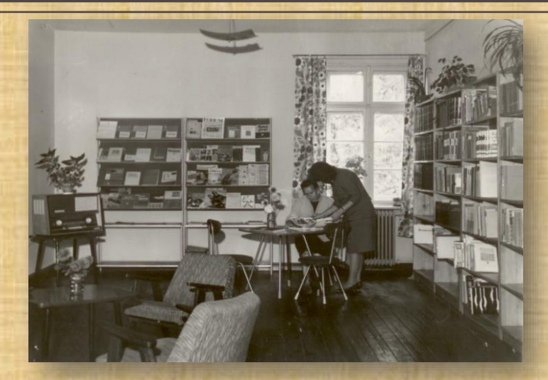
Library on Copernicus Street

Library in the building on Mickiewicza Street