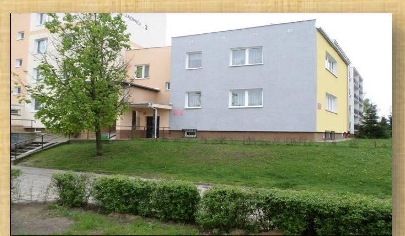
Library in the building in Queen Yadviga Street