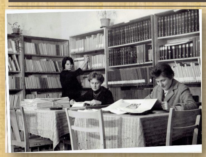
Reading corner – library premises 1-Maj street 14